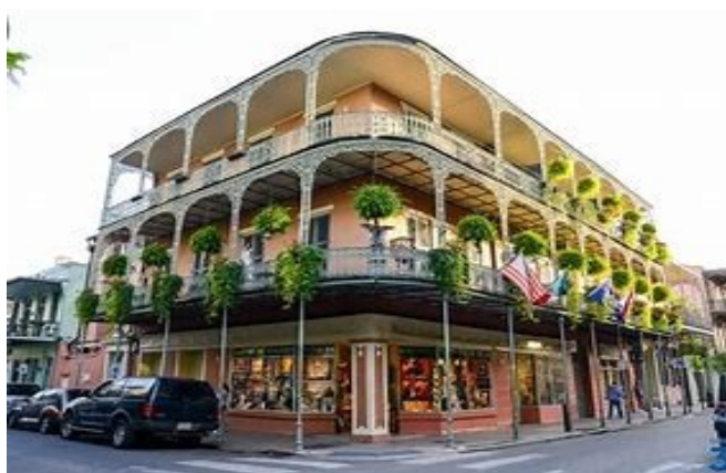
2021 New Orleans, LA

IMEC 2022 will be in St. Louis Oct 5 th thru 8 th at the Hyatt Regency. The room rate is $169.00 per night. It's a large hotel with three restaurants on site. The meeting spaces and guests rooms have just been renovated. Walking out the front door are the Gateway Arch Park and the Mississippi to the left and the Old Courthouse to the right. Four blocks away is Busch Stadium and the newly built Ball Park Village with shops, sports bars and restaurants. The hotel boasts 30 restaurants within a quarter of a mile. There is parking for $10/day just a block away and onsite valet parking which is quite a bit higher, but I am trying to get that reduced. It is a great "small" city with a vibrant downtown. There is a huge influx of young professionals moving into the old brick manufacturing buildings that have been transformed into modern living spaces. I found the area around the hotel to be clean, very safe and friendly.