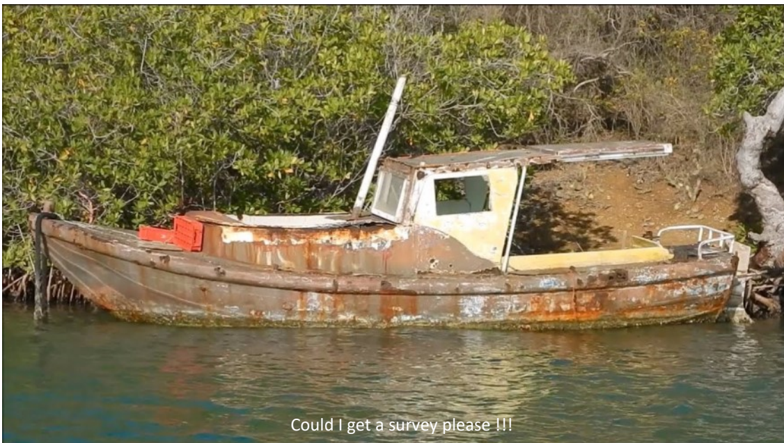
Could I get a survey please !!!