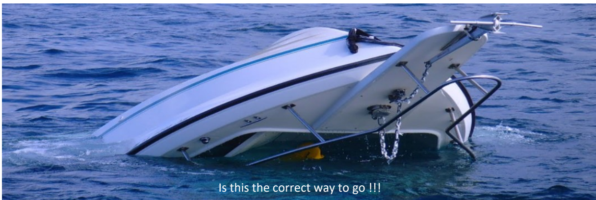
Is this the correct way to go !!!

So please review your reports and try to improve on every report you do! Your clients will be happy and so will financial and insurance companies. Do that and you will have no problem getting through as a Surveyor Associate and will be ready for your AMS ® upgrade.