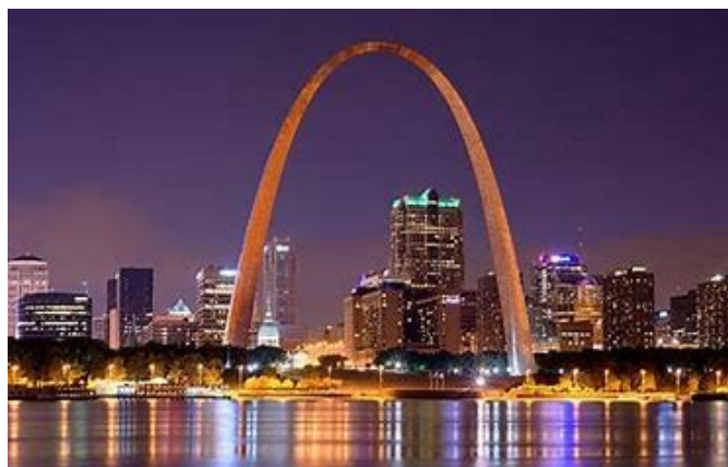
2022 St. Louis, MO