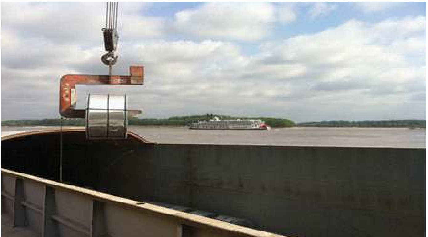
Surveying a barge load of coiled steel. P/V American Queen upbound on MS River.